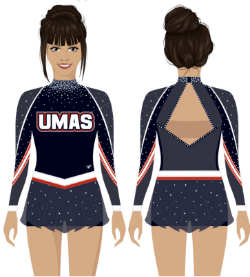
Mini & Youth Elite can purchase used*