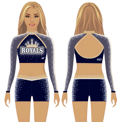
Royals Worlds can purchase used*