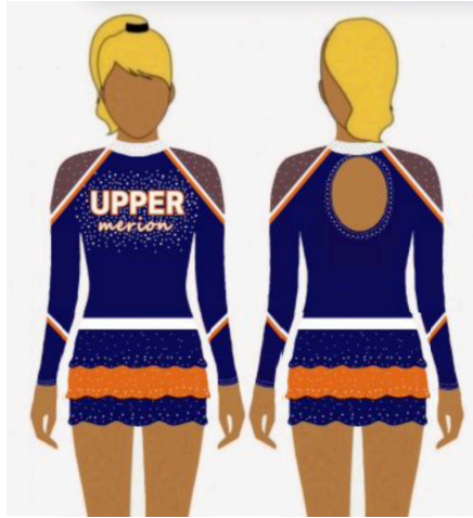
Mini & Youth Prep Teams can purchase used*