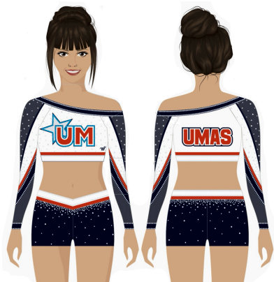
Senior Elite can purchase used*