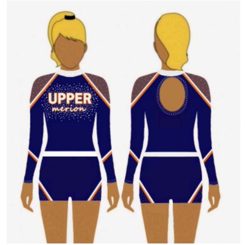
JR Prep Teams can purchase used*