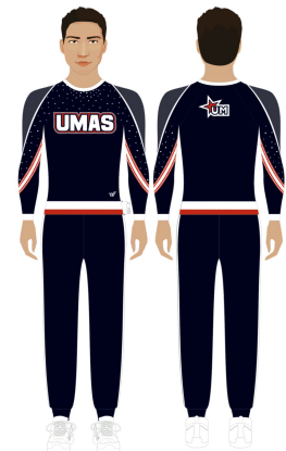
JR Elite Male can purchase used*