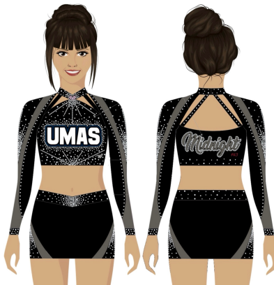
Midnight Worlds can purchase used*