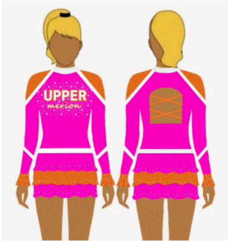
Novice & Tiny Prep Teams can purchase used*