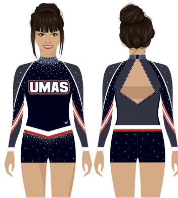
JR Elite can purchase used*